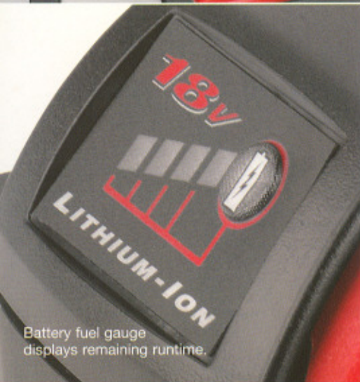
Battery fuel gauge displays remaining runtime.